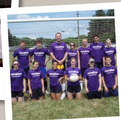
Get involved and have fun!