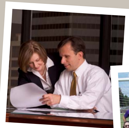
Develop your career at Meaden & Moore

As members of the American Institute of Certified Public Accountants, we participate in an extensive peer review program every three years, receiving a steady stream of unqualified opinions over the past three decades.